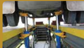
Suspended Ceiling Pits